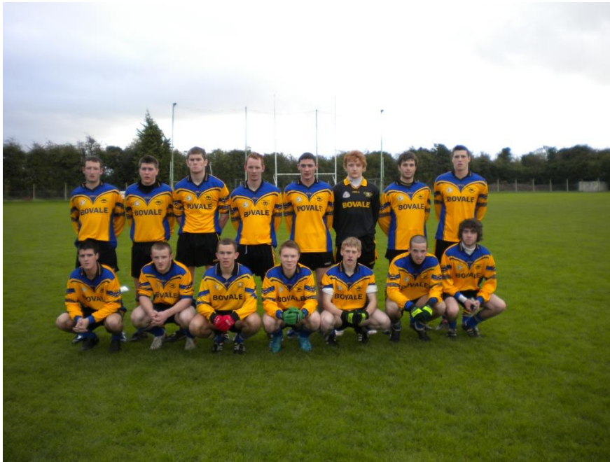
U21 team which played Kilmainham in Skyrne

The clubs U21 championship campaign was unfortunately short this year. We were graded in the A championship having qualified for the final in this section in 2009. It is a ludicrous situation that the quality of this years team is based on how last years team fared out irrespective of how many players from the previous year are over the age limit. No heed is passed on how the respective teams did in the minor campaign 3 years before. Such is the logic of the grading system and I suppose we are stuck with it.