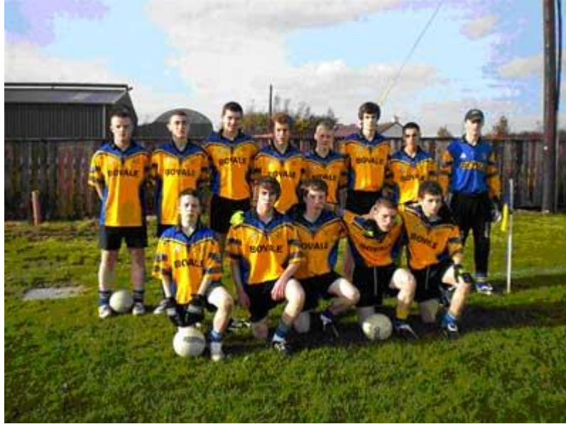
The team which played Moynalty in Batterstown on the 17 th October.